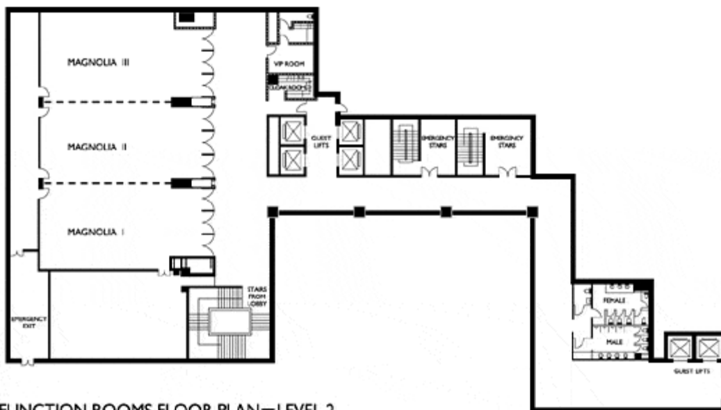
FUNCTION ROOMS FLOOR PLAN—LEVEL 2